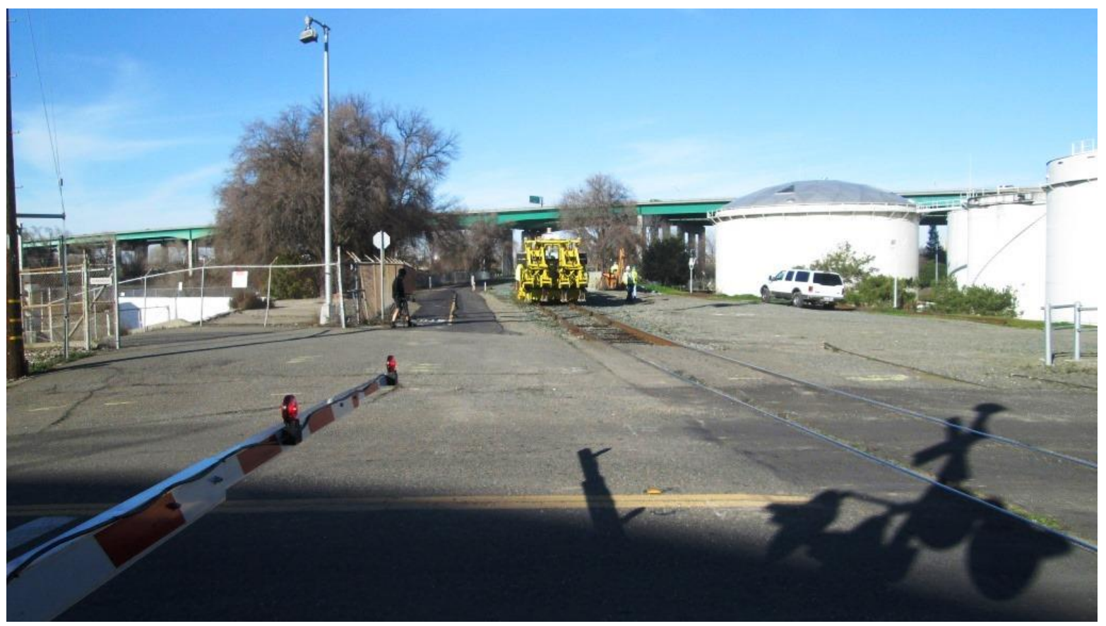
After lunch, the Team returned to Broadway to continue their endeavors