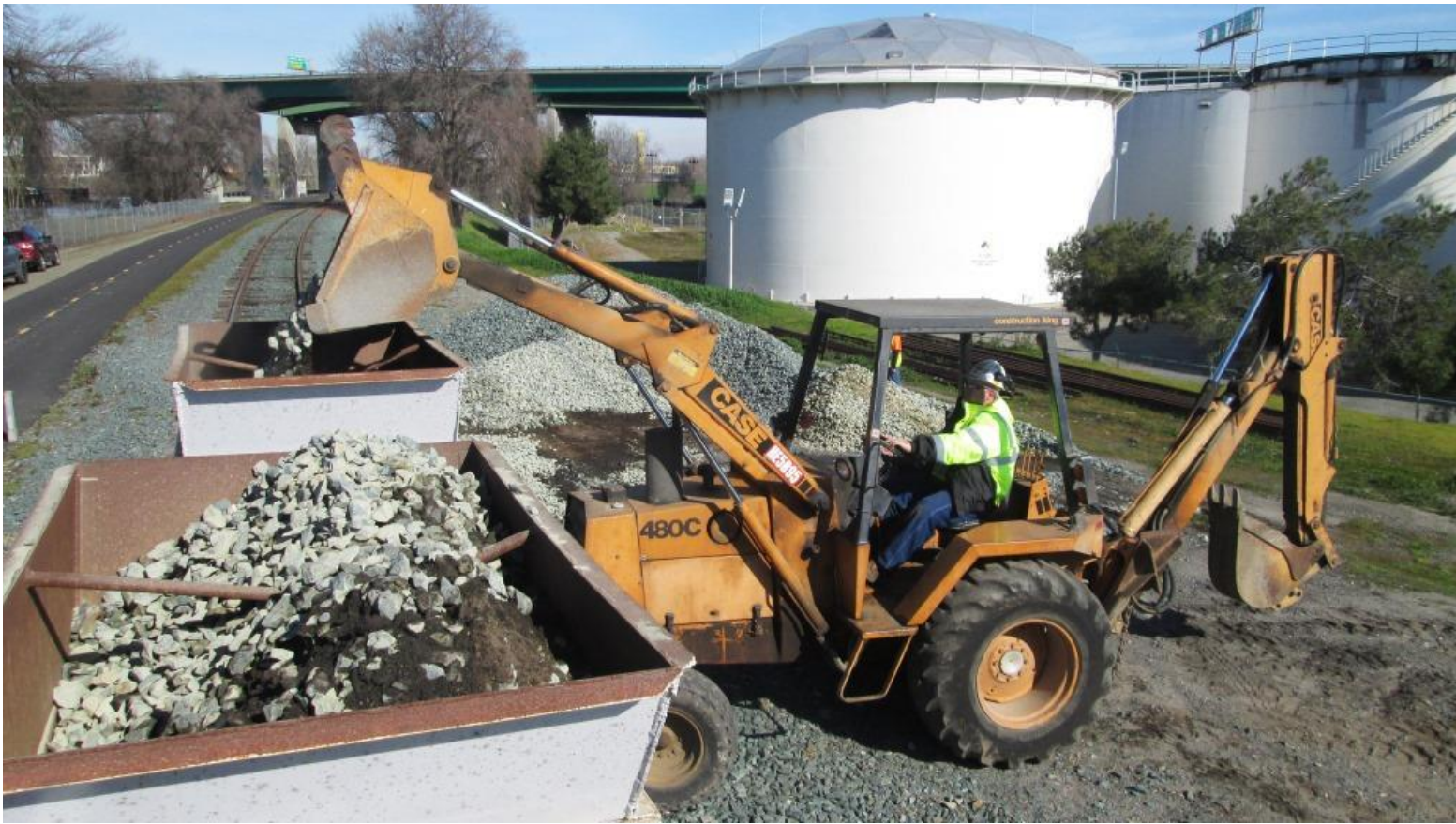
A more dramatic view of Mike F. loading rock into the hopper-cars