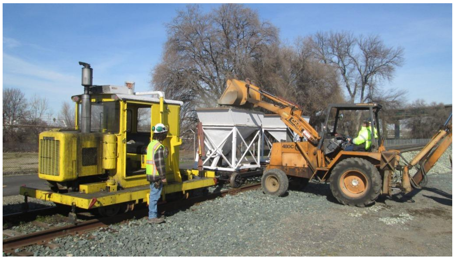
With the presentation done, Mike F. on the back-hoe loads the side-dump hoppers