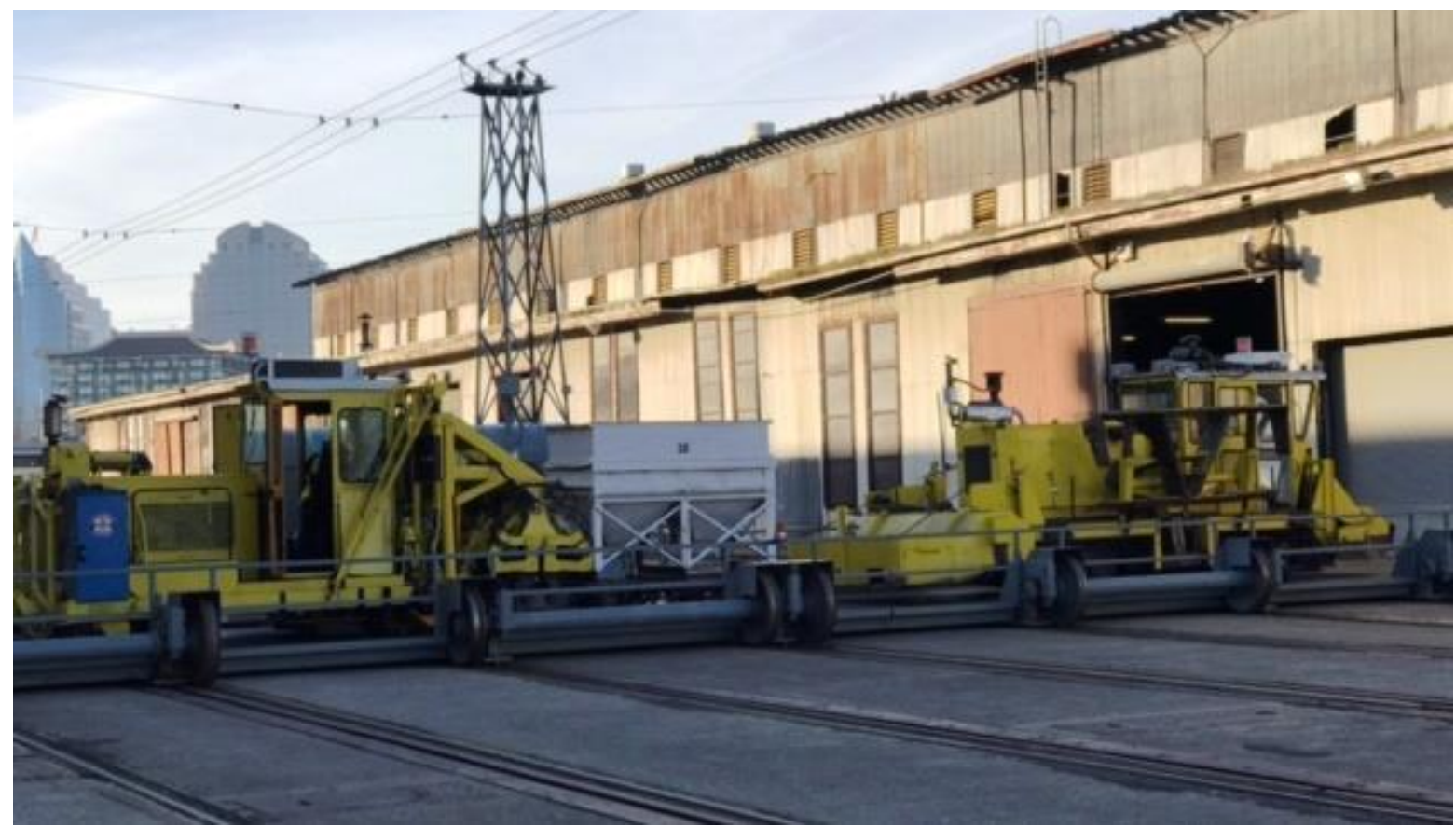
The tamper and ballast regulator are ready to roll – or so we thought...