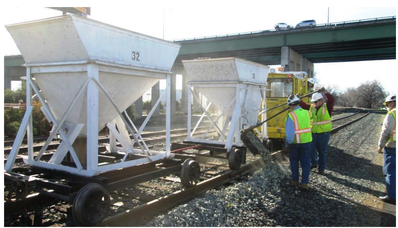
Clem and Josh pour ballast-rock onto the opposite side of the track