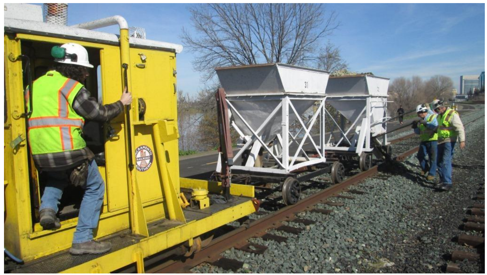
With Matt at the controls of the Kalamazoo creeping south, Alan and Clem disgorge rock along the line