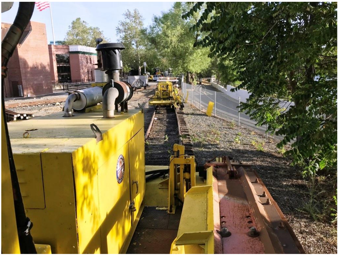
Jack brings the Jackson 125 back onto the 150-Track