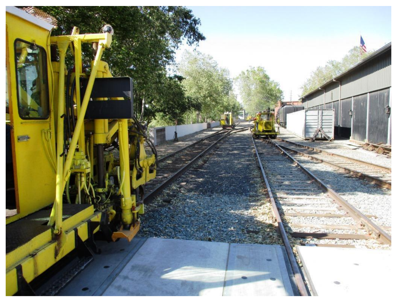
Back in Old Sac., the "great yellow fleet" gets switched around