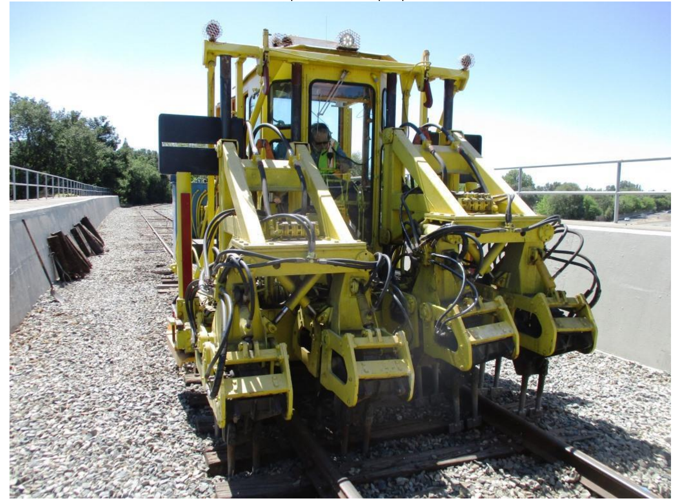
Alan tamps the bridge track