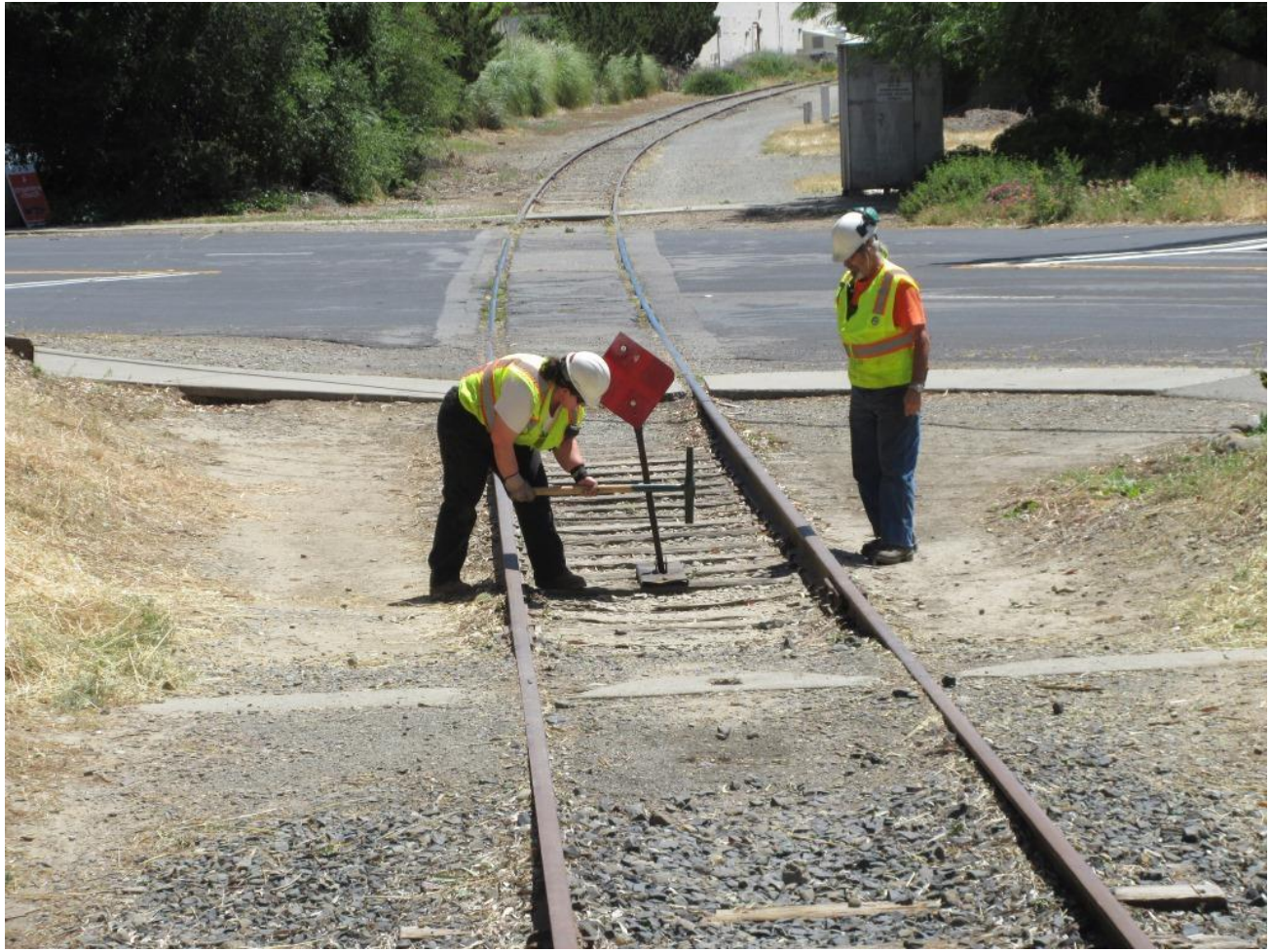
Heather and Ed re-establish the red-flag at the end-of-track at Mile Post 3.52 Sutterville Road