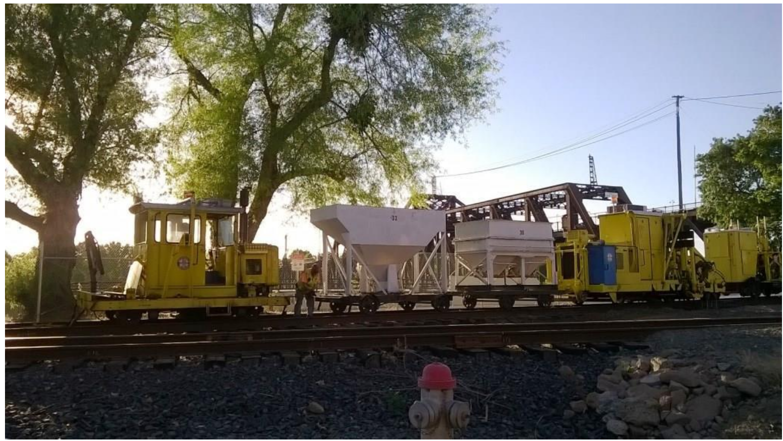
...and spot them on the 150 Track