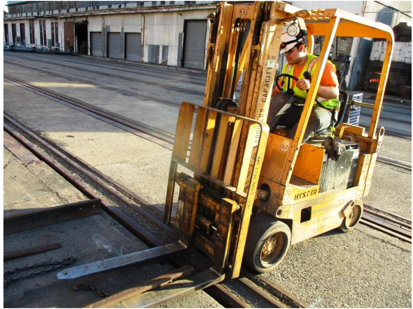
With the weight of the hoppers off the snap-track, Chris is able to square it up with the yellow Hyster forklift