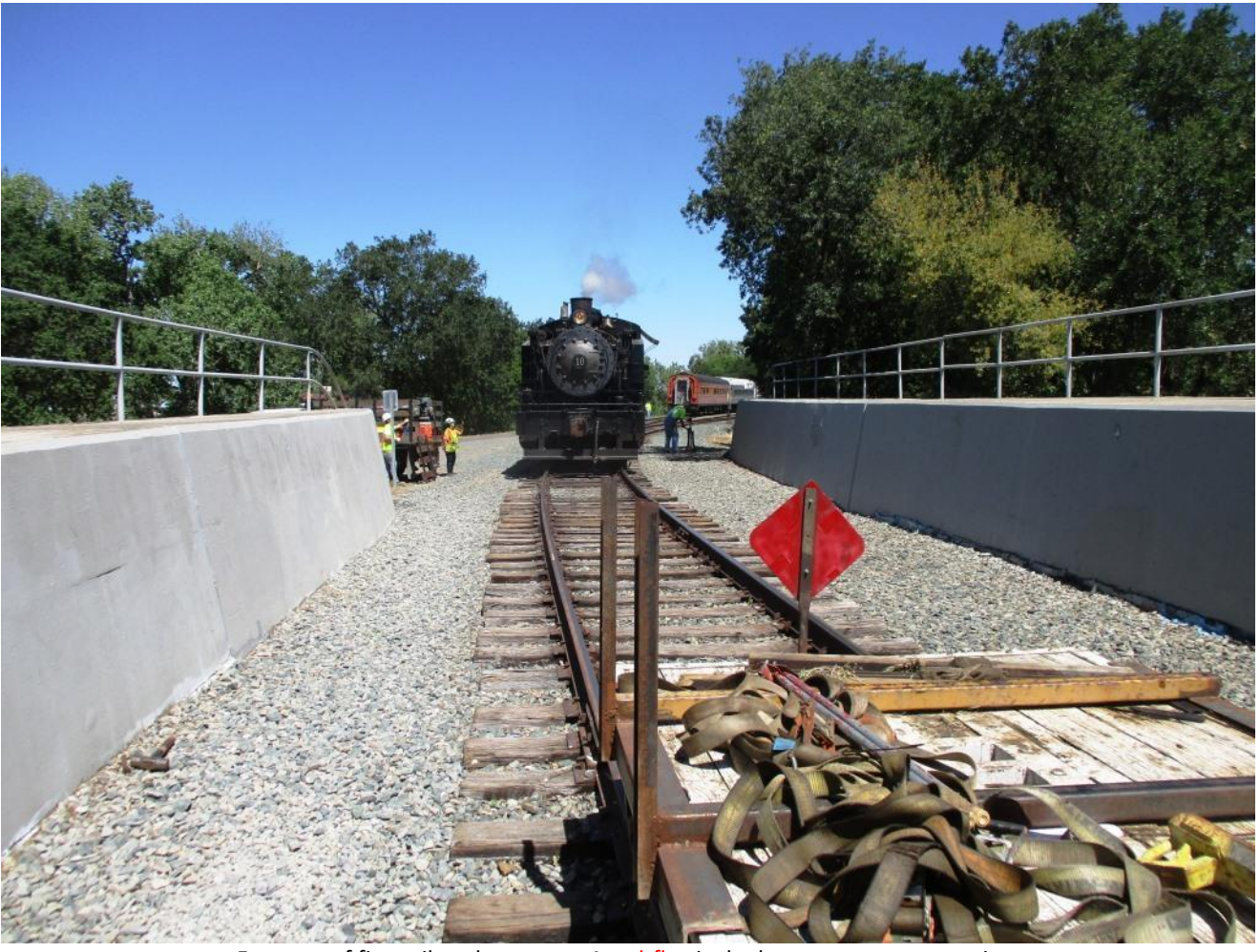
Four out of five railroaders agree. A red-flag is the best way to stop a train...