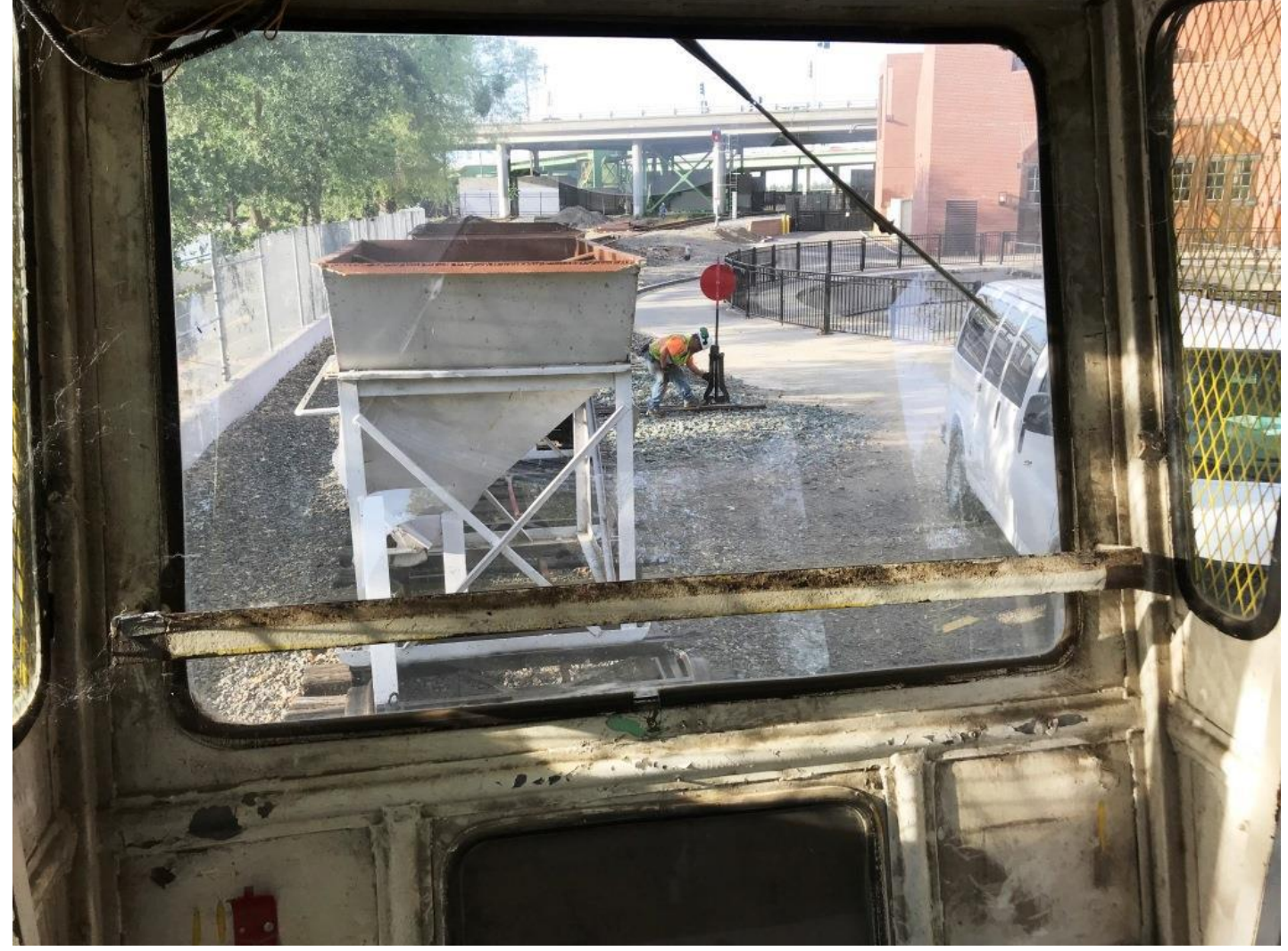
Joe switches the ballast regulator and hoppers onto the 560 Track

Ed on the back-hoe fills a hopper-car with rock