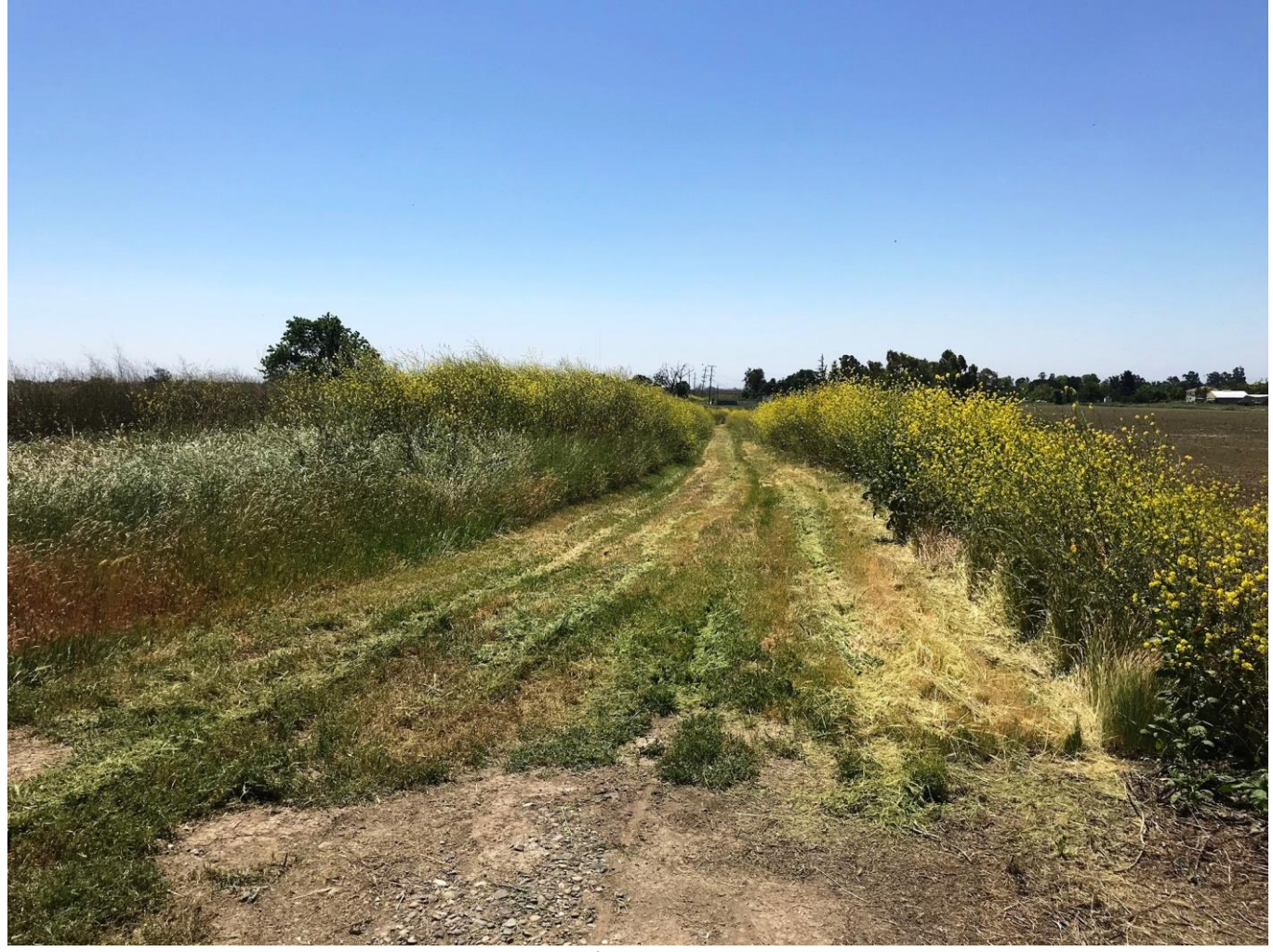
The driveway at Hood after the Weedies had been there