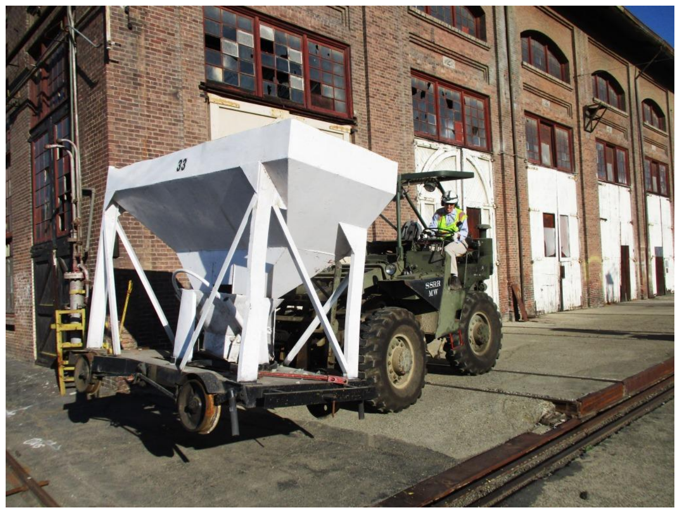
When that didn't work as anticipated, Steve picks up the hoppers with Big Green and moves them to the transfer table