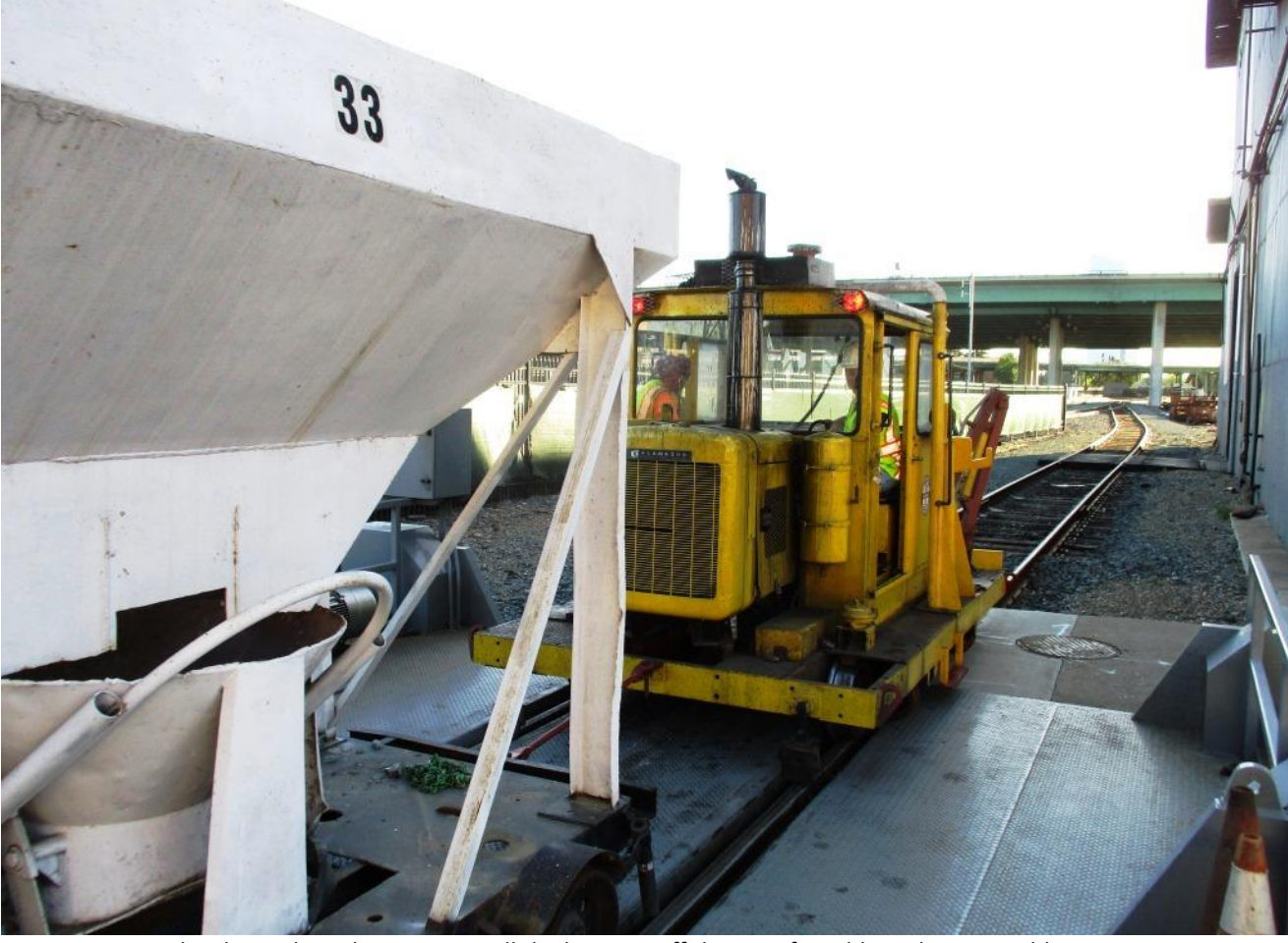
Joe and Jack use the Kalamazoo to pull the hoppers off the transfer table and over to Old Sacramento