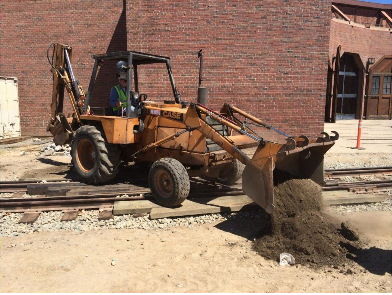
Alan in the back-hoe building the ramp on the west side of the Whisker Track