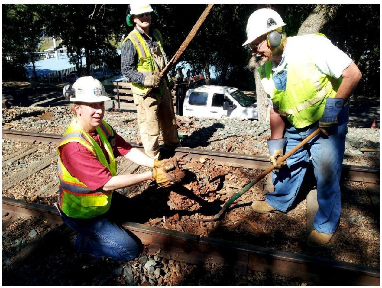
This is a tie?