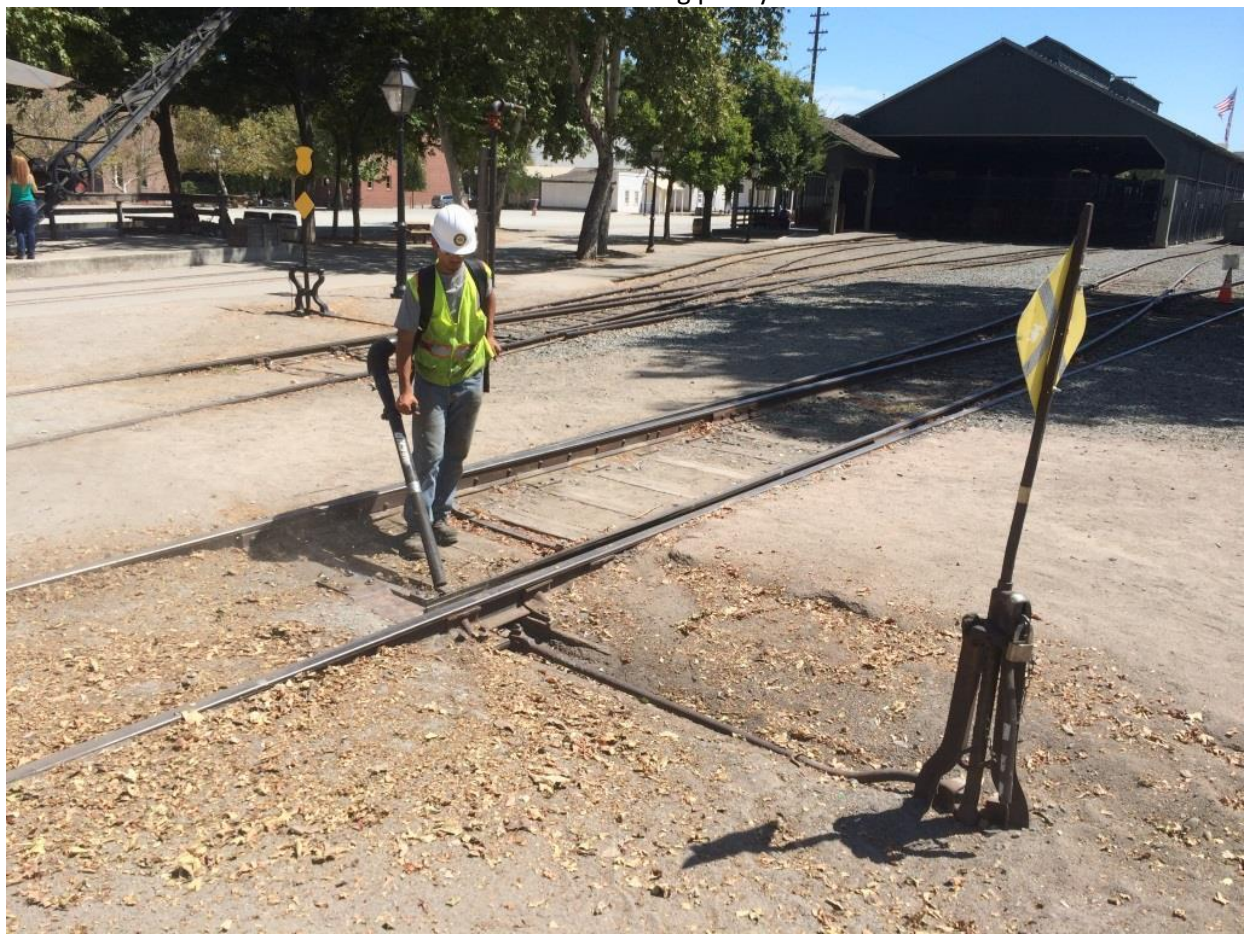
The DSWMO takes on Switch 2