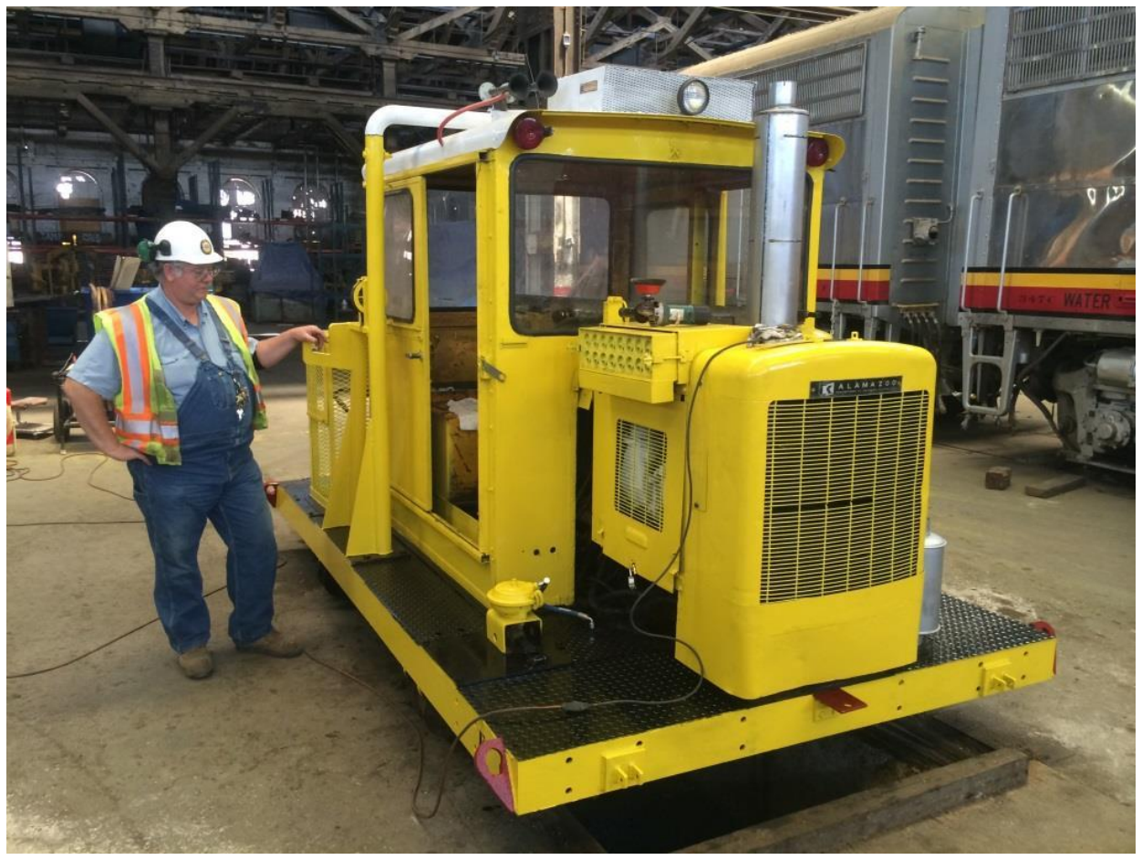
The Kalamazoo is looking pretty sweet!