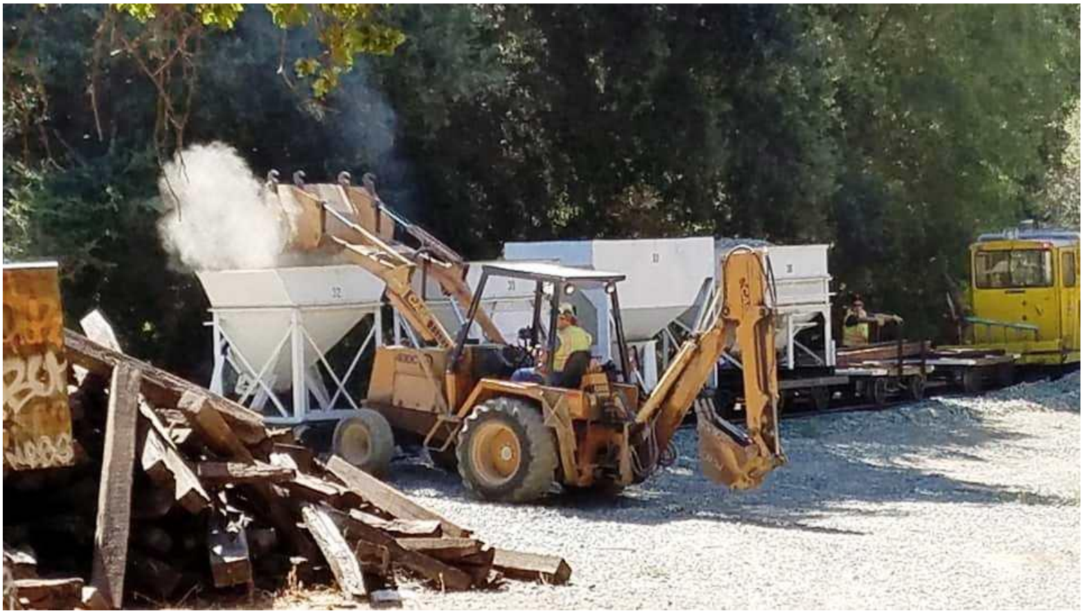
Mike fills the hopper cars with ballast rock