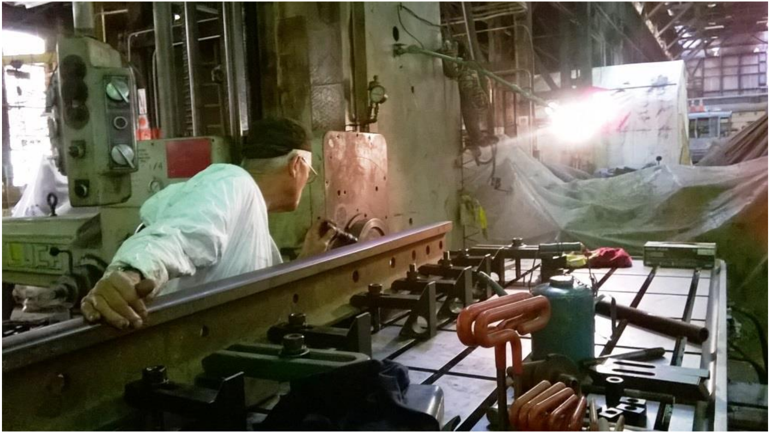
Jim Bays works on milling a new wing-rail for the frog at Switch 20