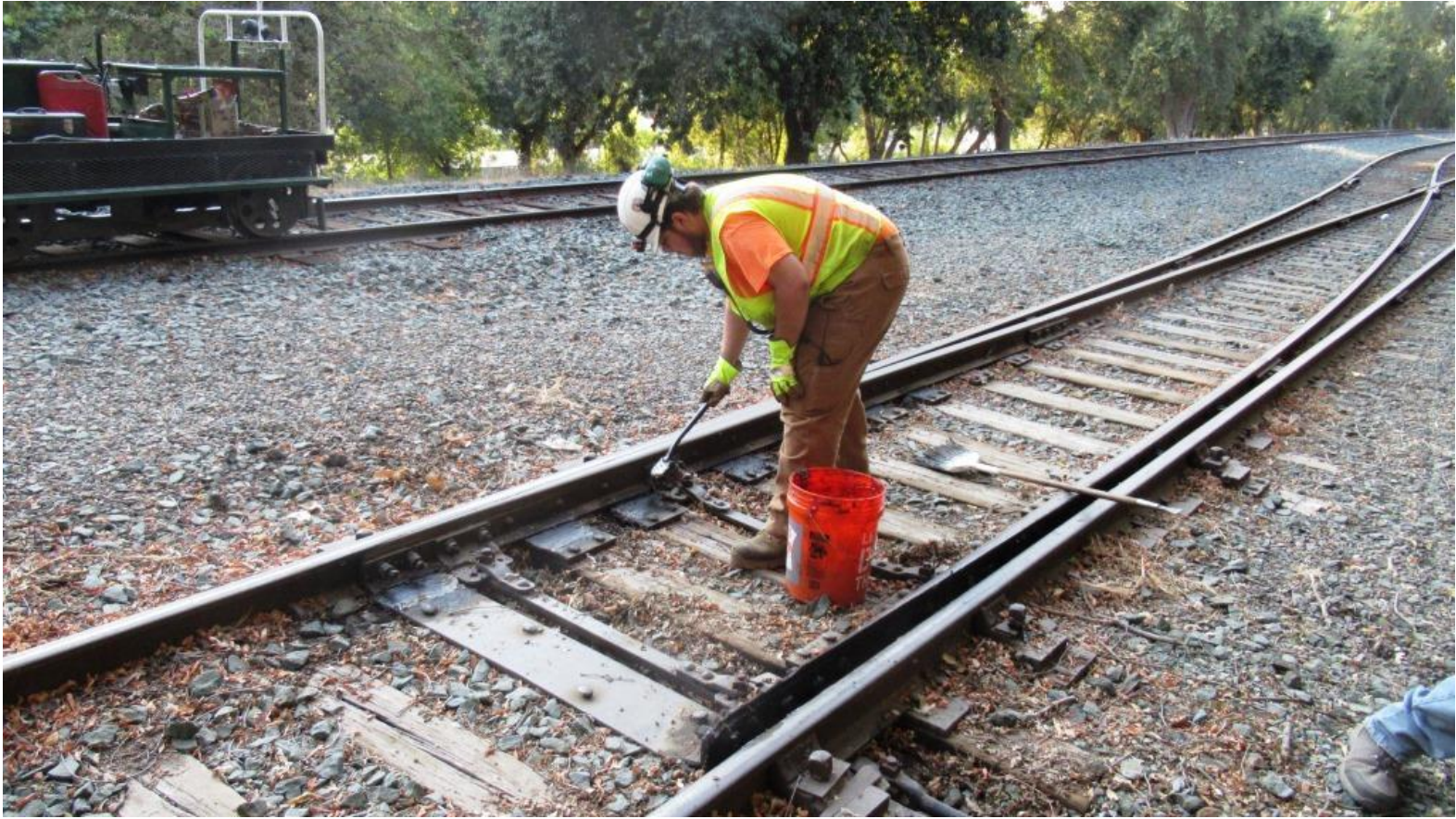
Chris slathers switch grease all over the place