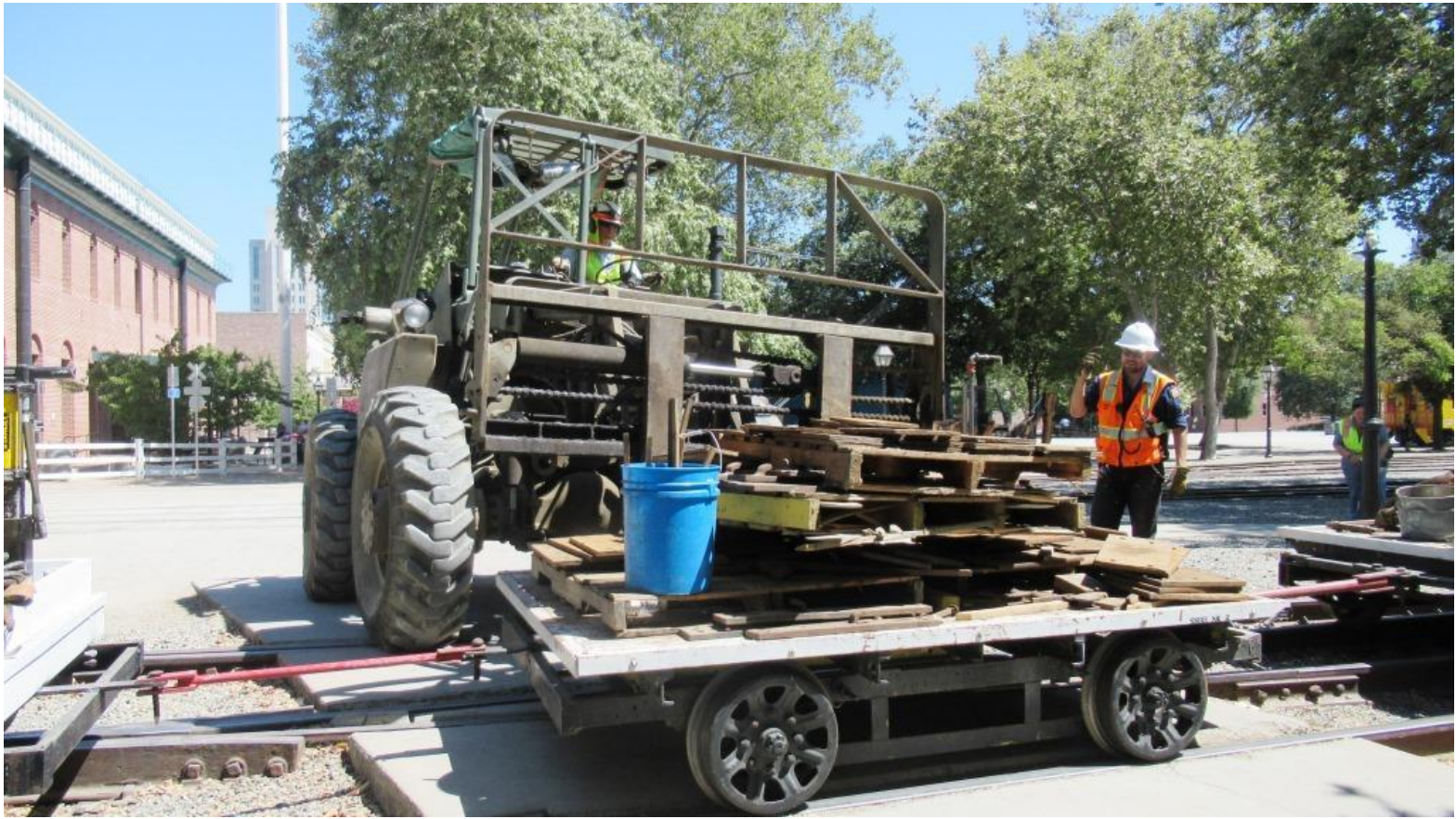
Kyle acts as loadmaster for Steve on Big Green as they grab a pallet of plates for the guard-rail