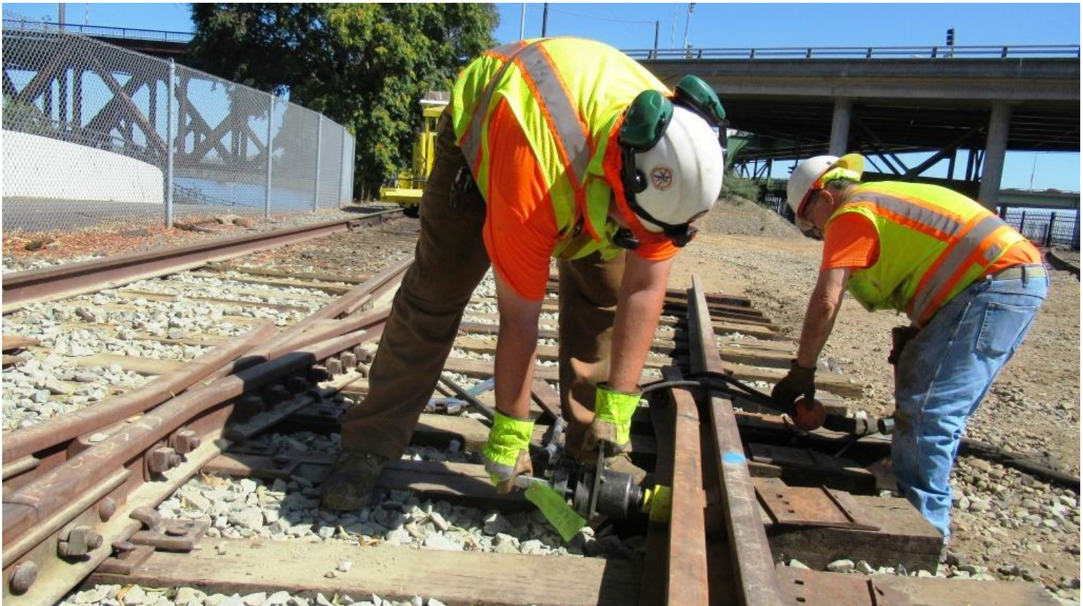
Chris uses the hydraulic impact-wrench to tighten-down the bolts on the guard-rail