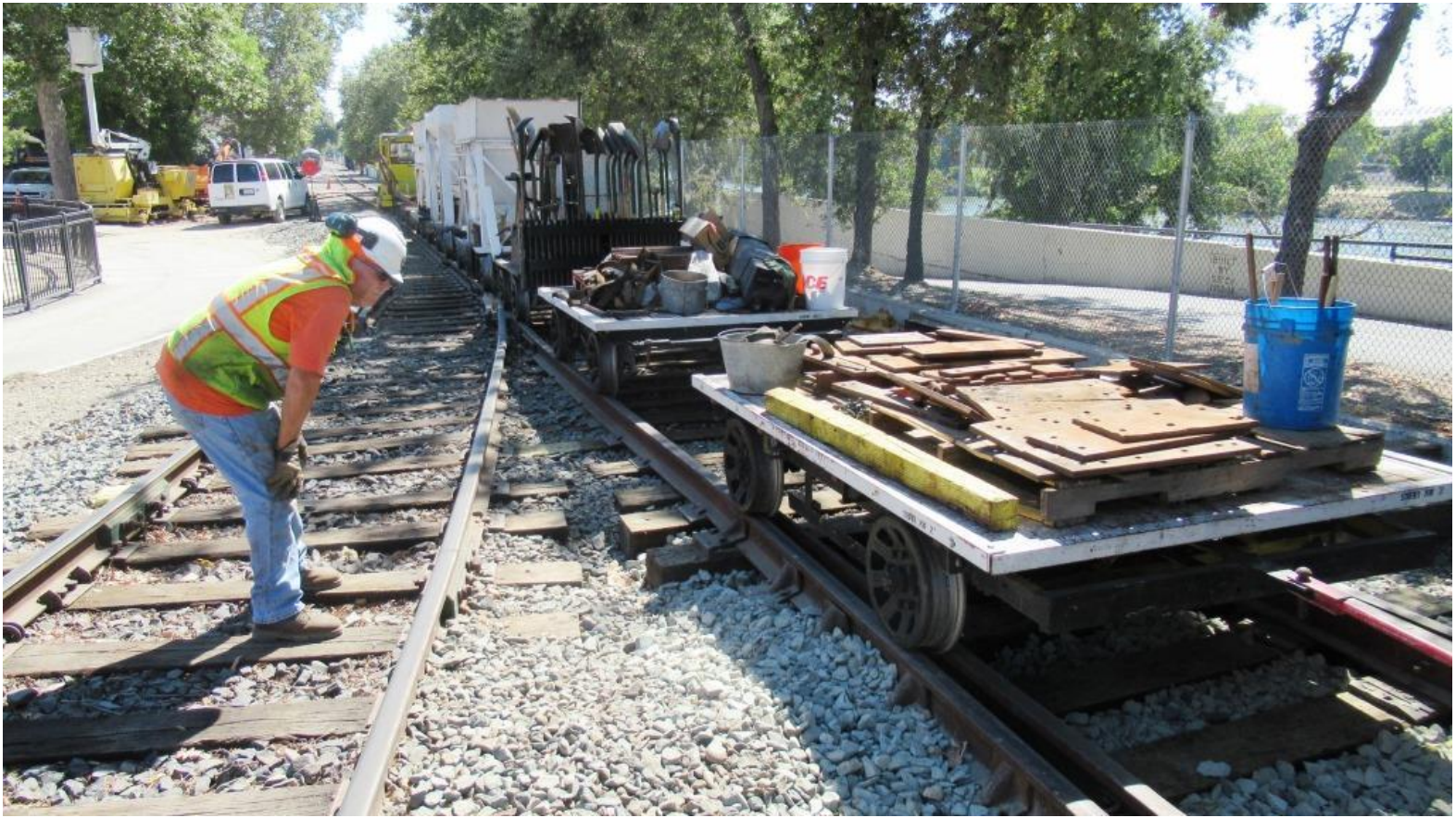
Bill confirms that the guard-rail is doing what it's supposed to do