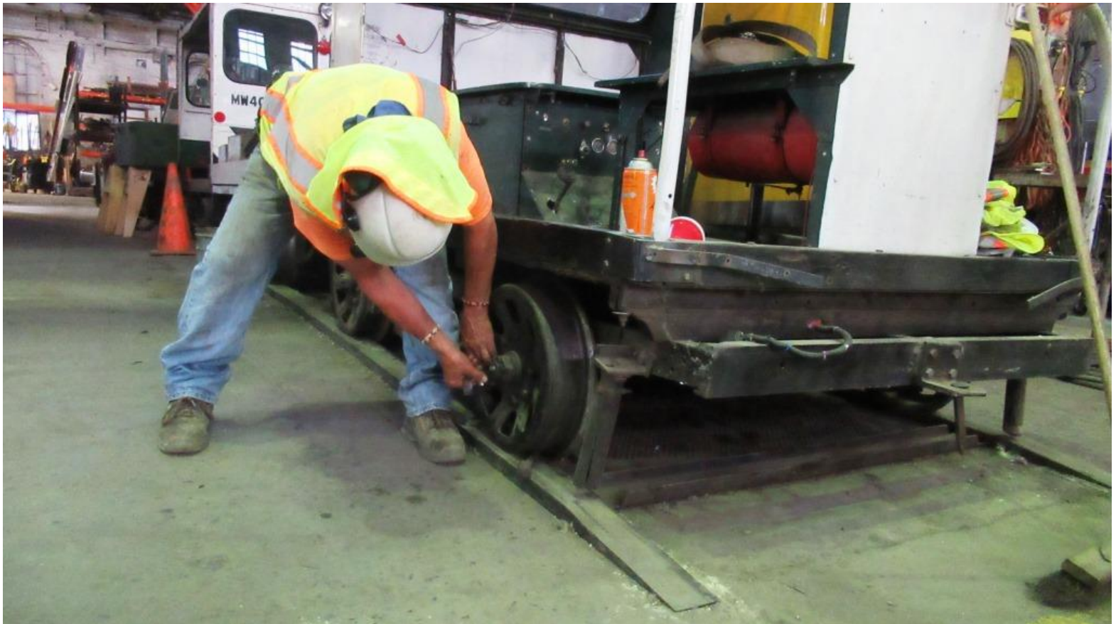
Joe affixes new shunts to the A-5 motorcar's wheels