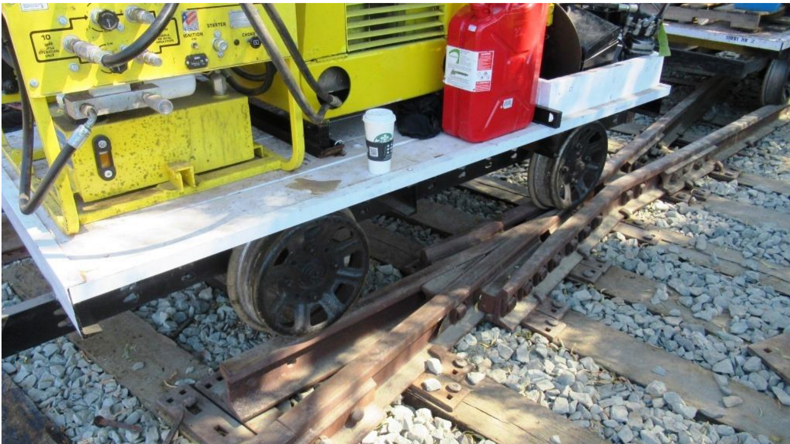
Yea! It works! And, nope, the train did not fall off the tracks!