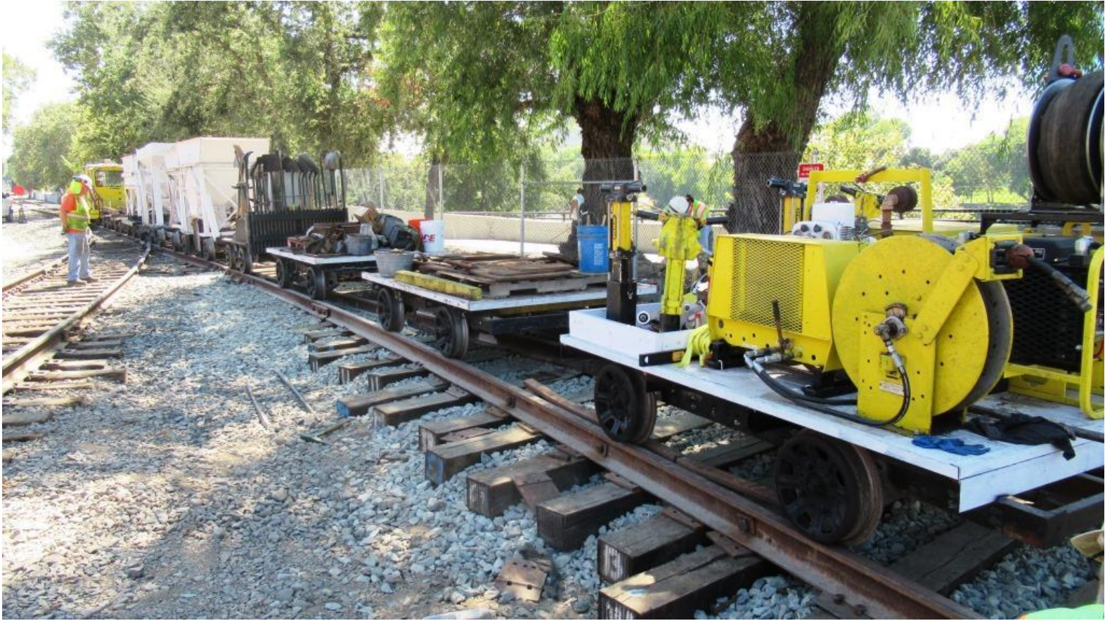
Matt skillfully maneuvers the work-train through the new guard-rail for the first time