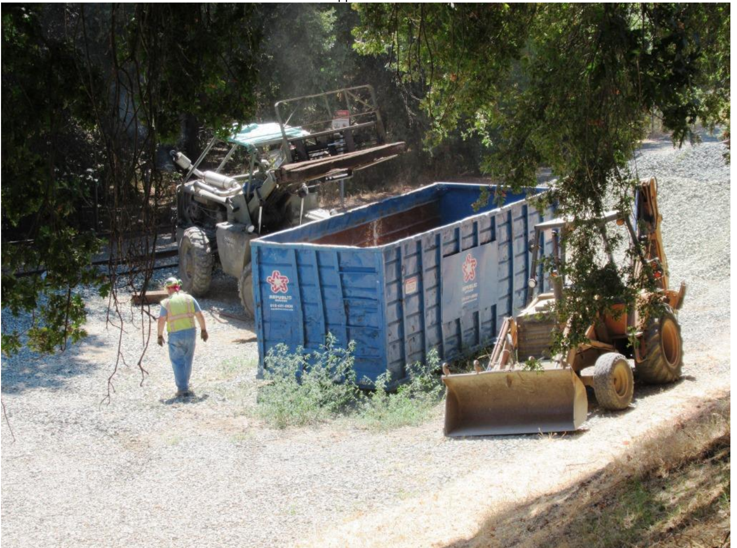
While down at Setzer, Steve dumps dead-ends into the dumpster