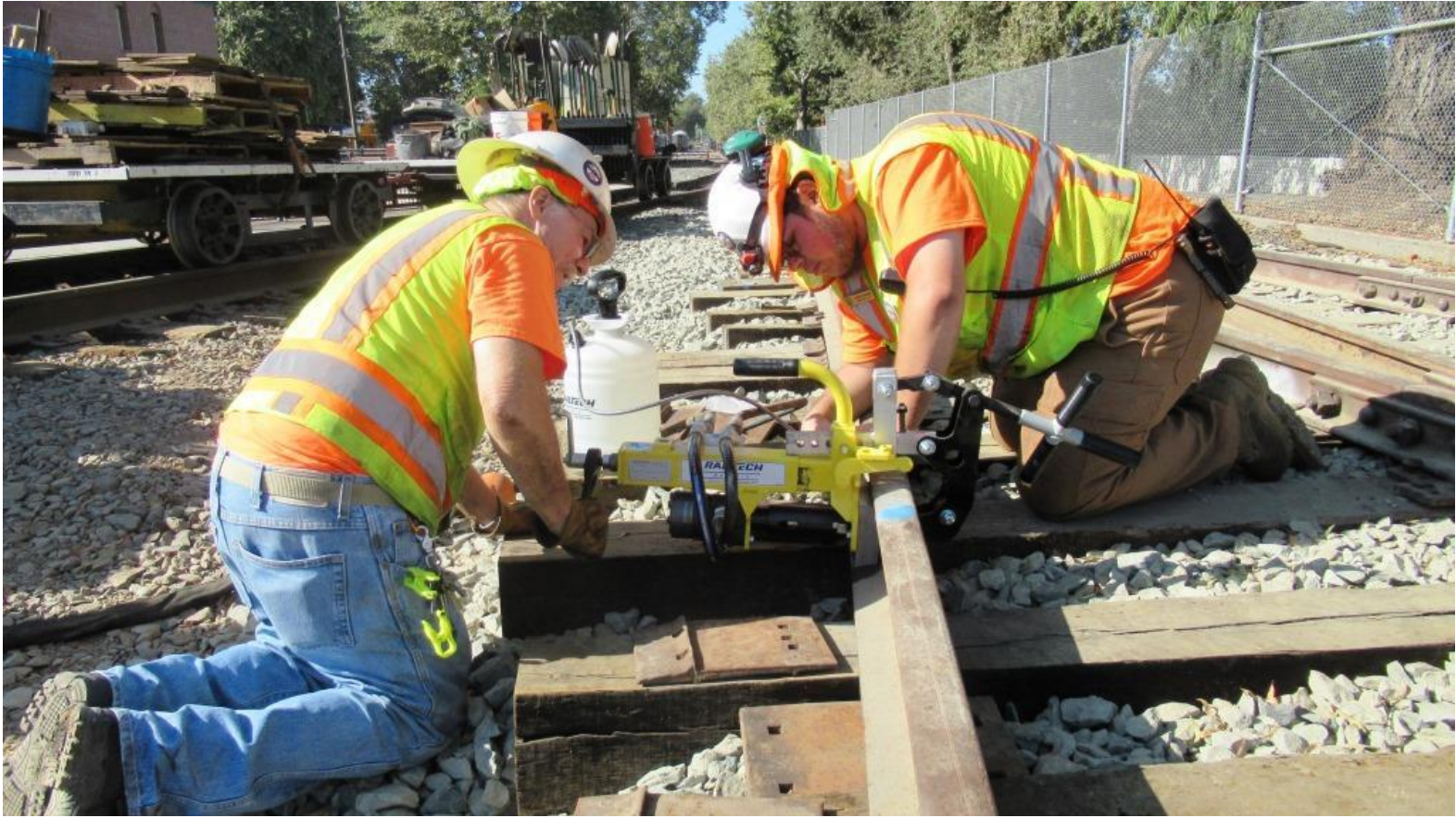
In a matter of moments, the drill bit is spinning and punching its way through the web of the rail