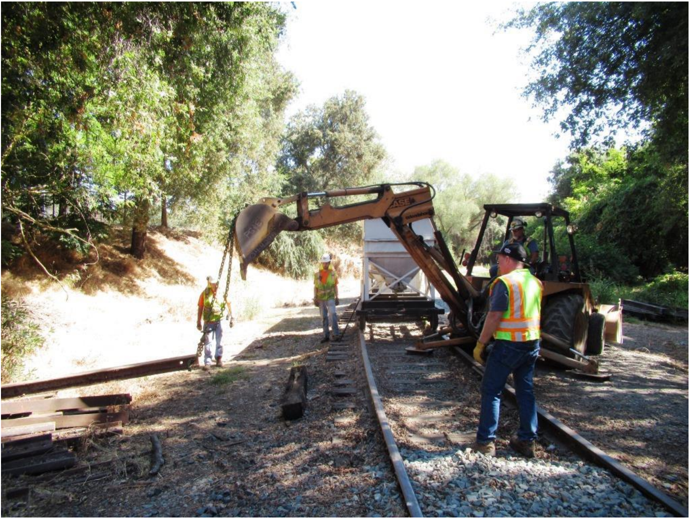
Mike F. on the back-hoe yanks the first stick out of the pile