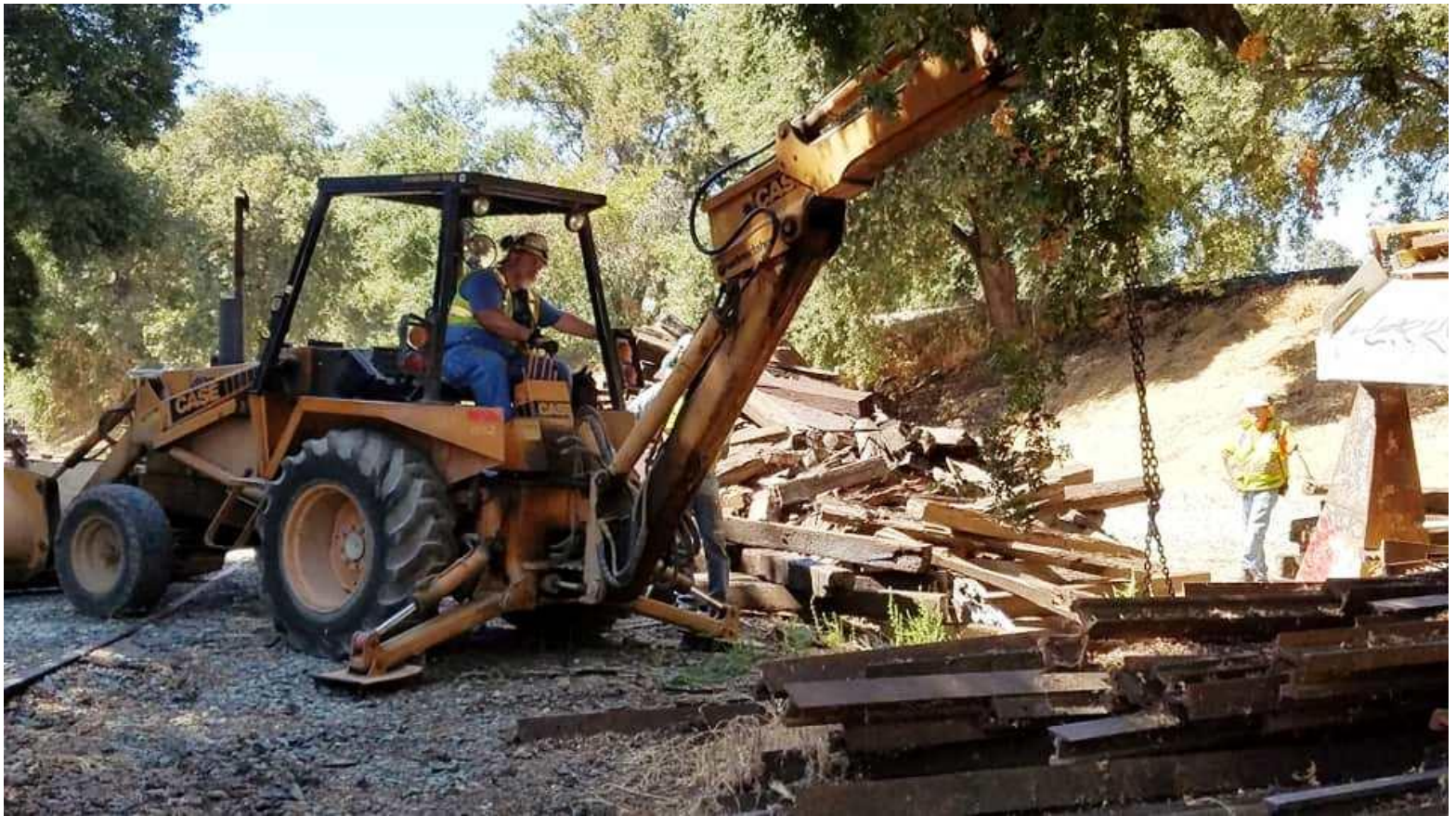
Mike F. pulls the next stick out of the pile