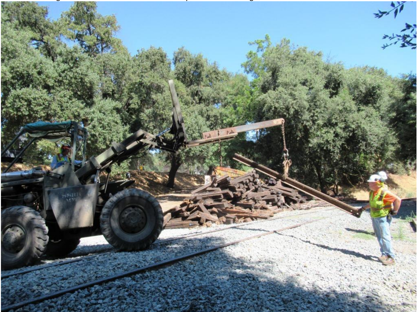
Now Bill guides the next stick of rail