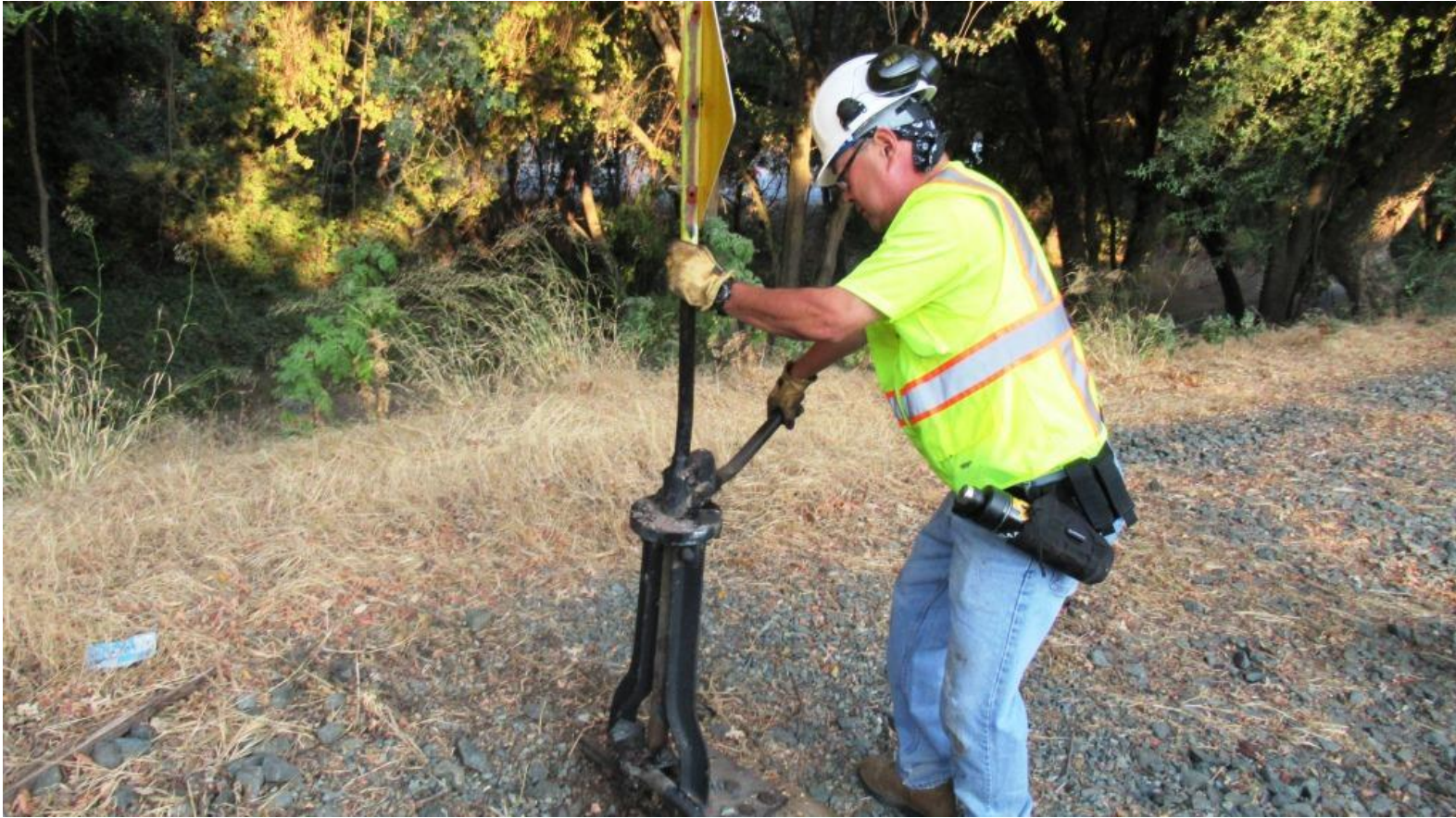
Taka now tests the throw of the switch and gives it a big thumbs-up