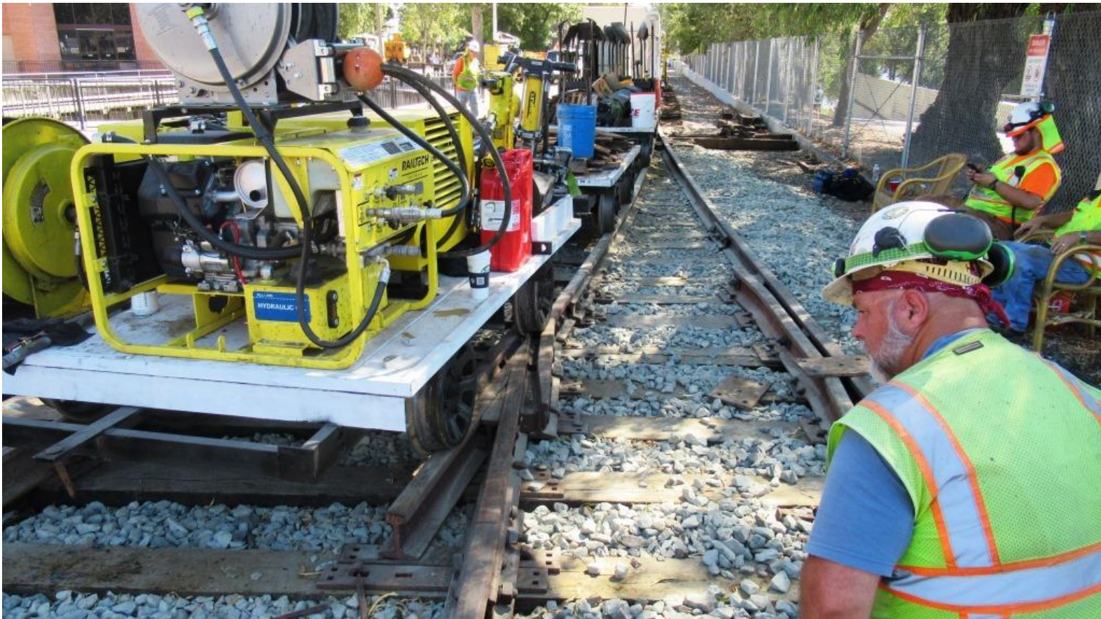
Mike F. keeps a close eye on the wheels as they roll into the correct flange-way on the frog