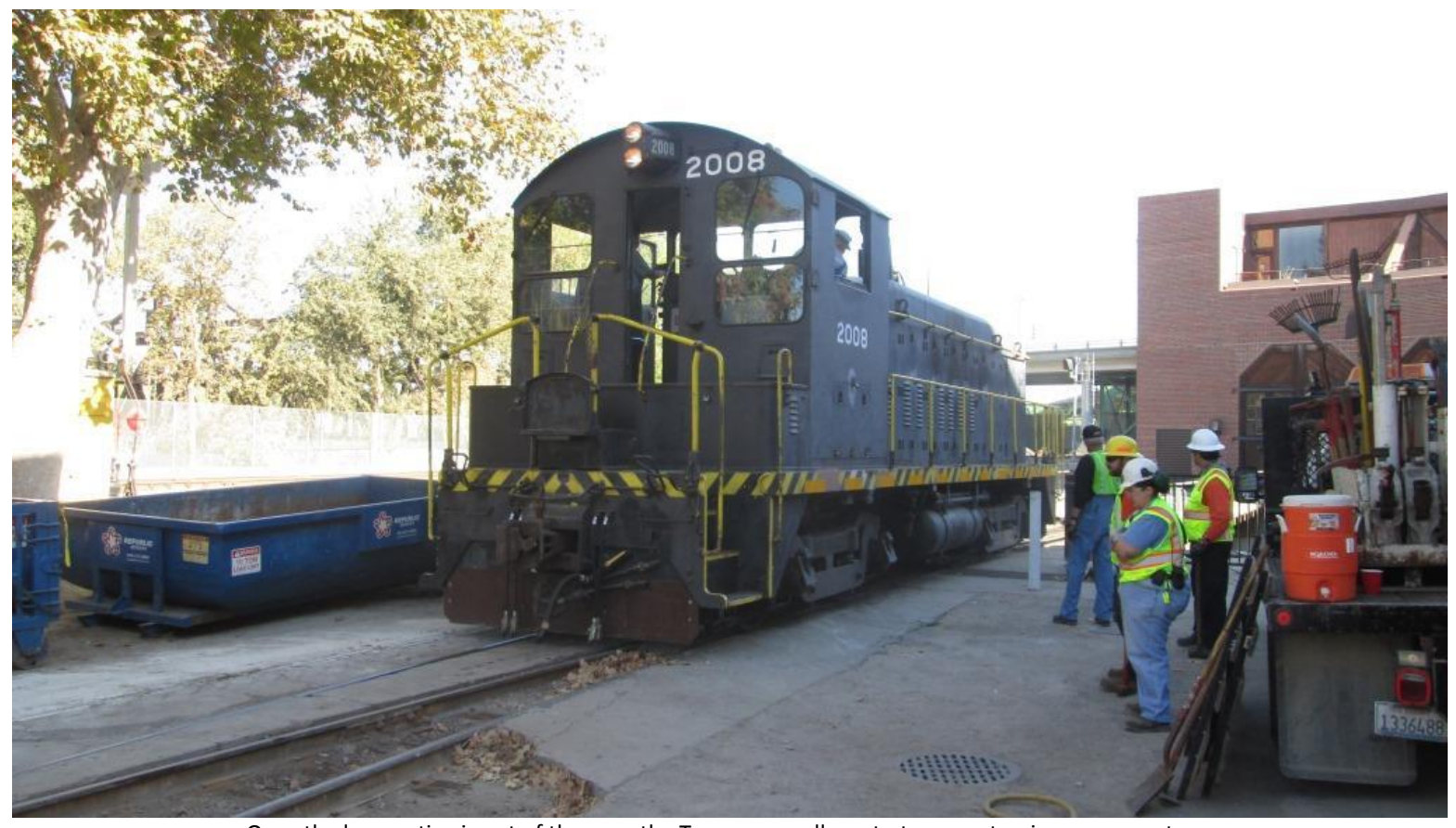
Once the locomotive is out of the way, the Team can really go to town on tearing up concrete