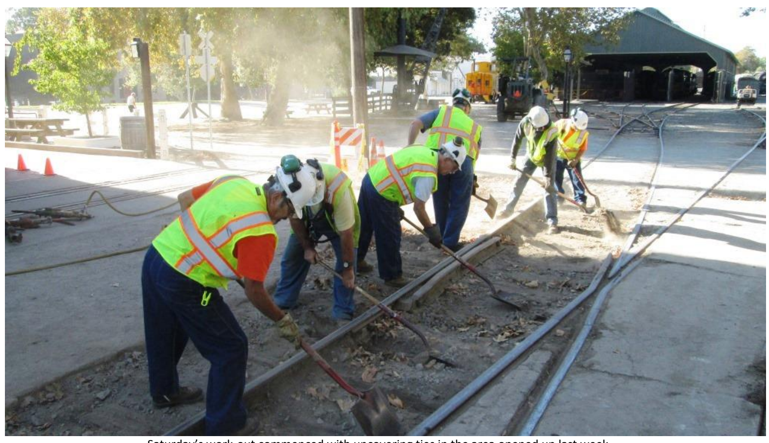
Saturday's work-out commenced with uncovering ties in the area opened up last week