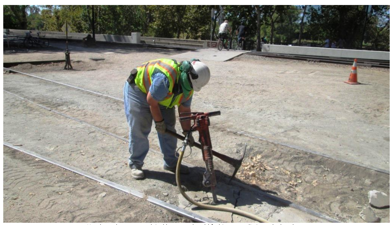
Heather takes on a stuck jackhammer the old fashion way: dig it out by hand...