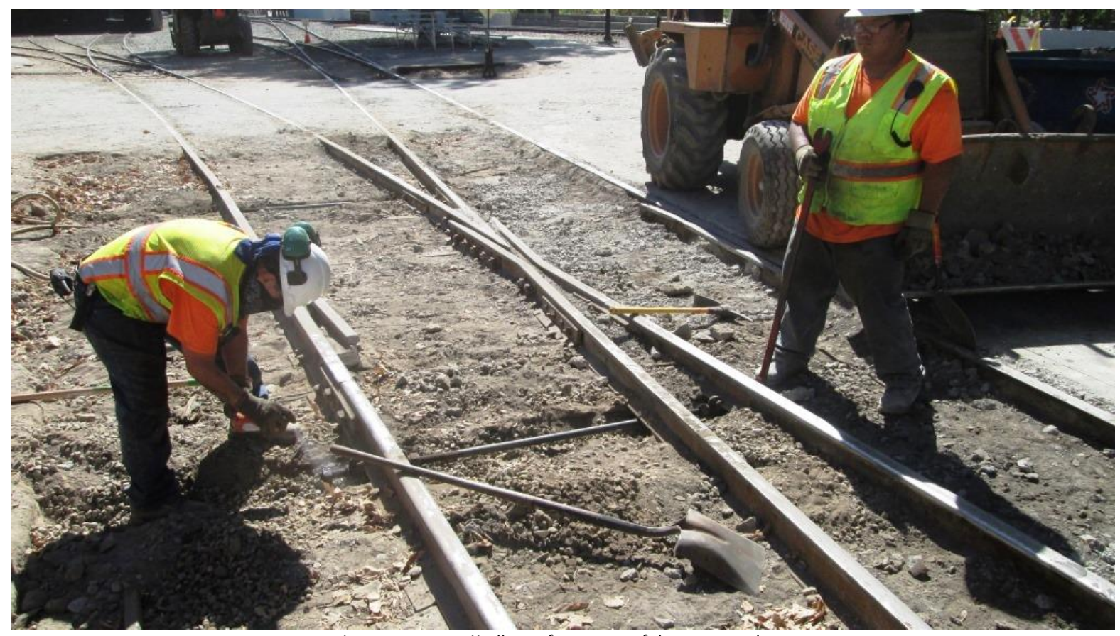
Joe sprays some Kroil on a frozen nut of the gauge-rod