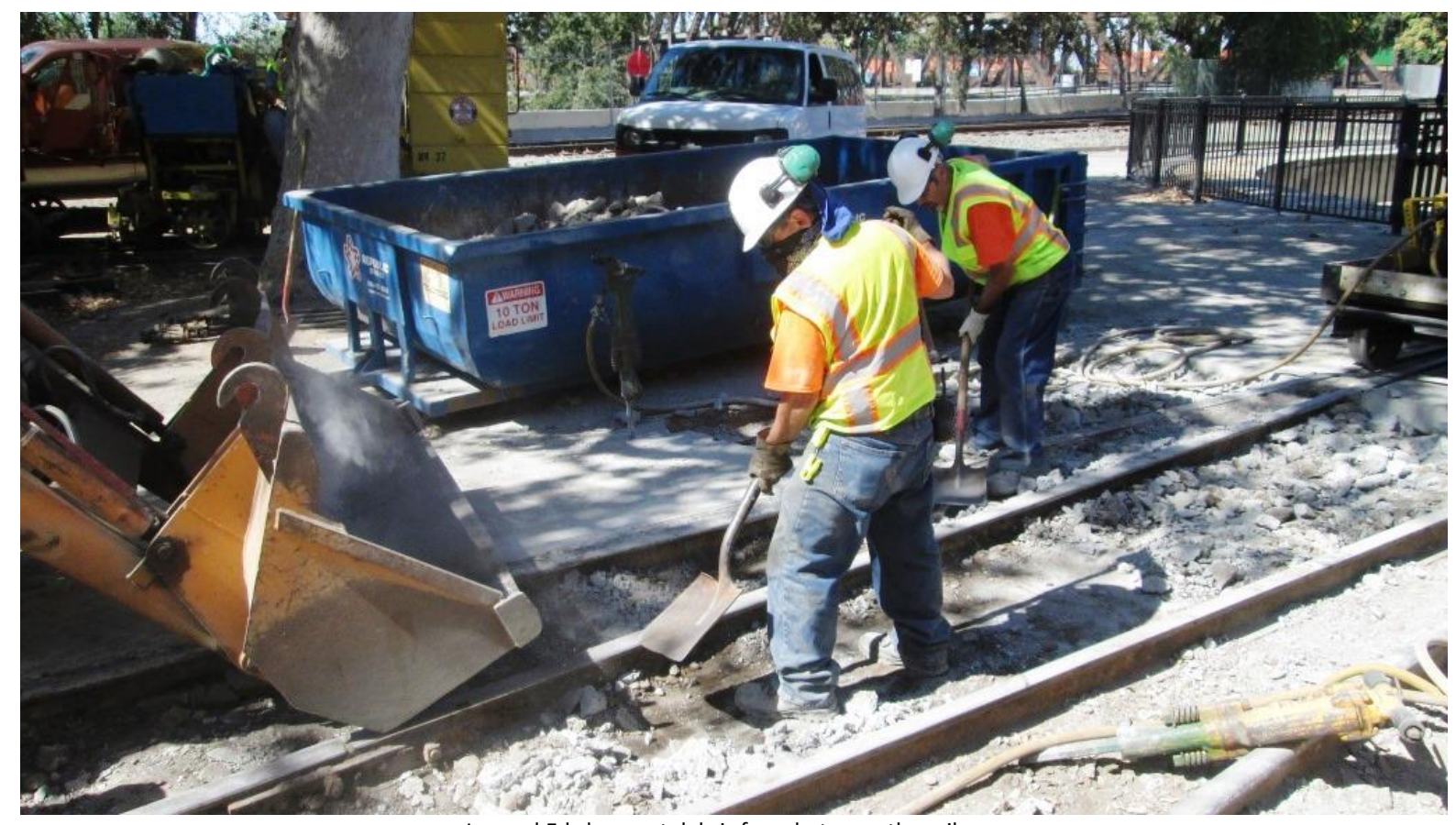
Joe and Ed clean out debris from between the rails