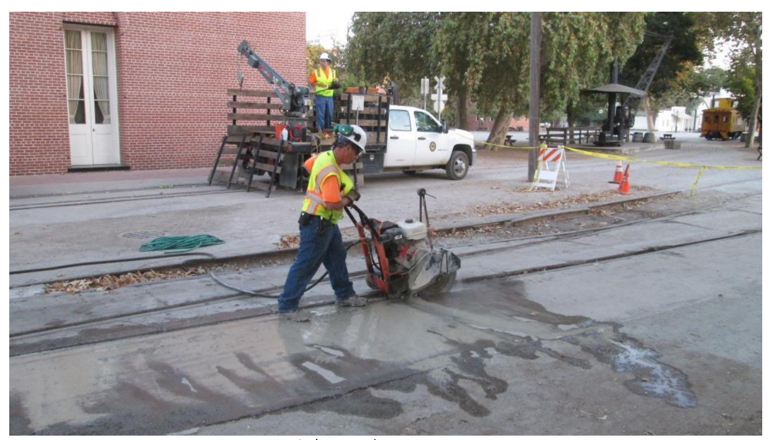
Joe's next on the concrete saw