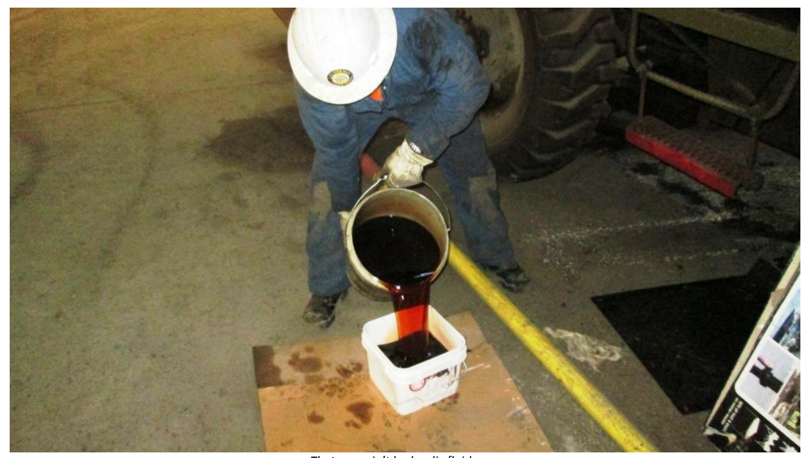
That sure ain't hydraulic fluid...