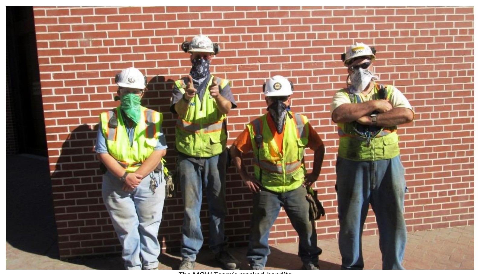
The MOW Team's masked-bandits