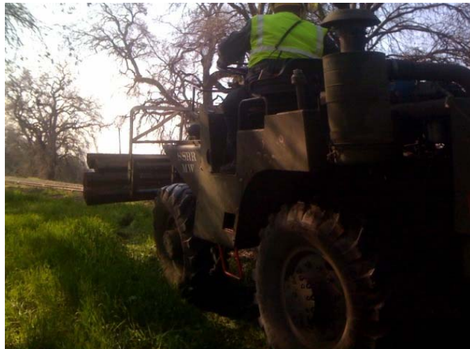
Ed bringing in more ties with the Green Machine.

Thursday: Again we will be working in the shops starting only at 5:00 p.m. with a continuation of all the projects worked on from Tuesday and a few new ones added in just for good measure.