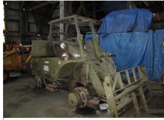
MOW Green Machine #2 with its wheels removed

Hello MOW Folks and welcome to the latest edition of the one and only... MOW UPDATE! (Please hold your applause until the end of the update) Before we get into the meat of the update, a quick reminder for those of you who might be interested in participating in the Ione trip with the firetruck, we need you to RSVP by reply e-mail your intent by Wednesday, we need a crew for both Saturday and Sunday. .